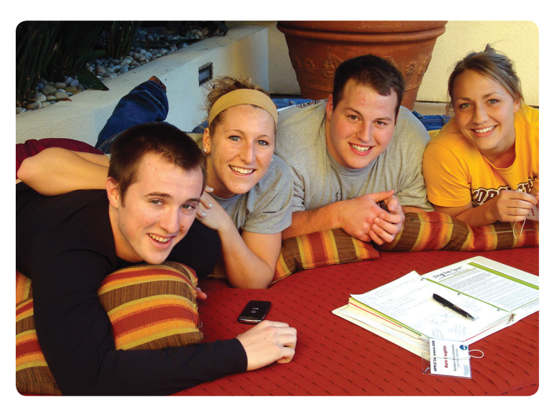
2009 Northern State University APPLE Team