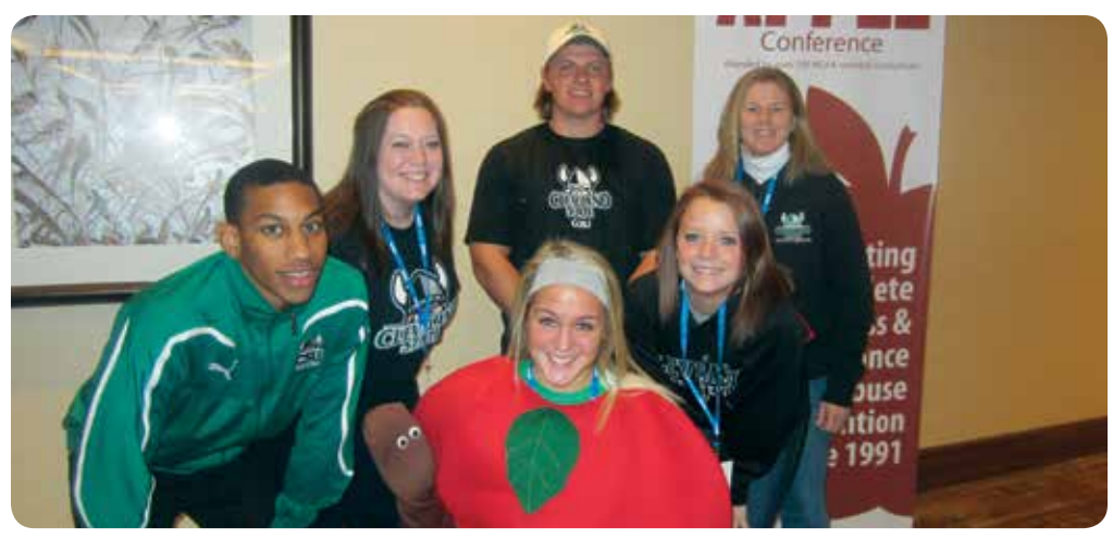
Cleveland State University's team at the 2013 APPLE Conference in Indianapolis.