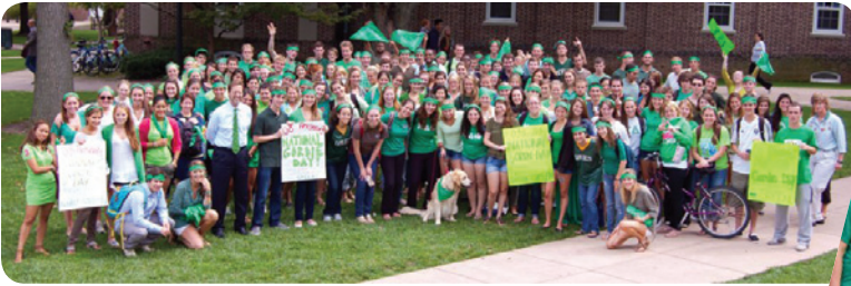
Students at Franklin & Marshall College rallied together to celebrate National GORDIEday! The student-run organization F&M .08 works to promote responsible drinking through alcohol education and also hosts alcohol-free events on campus.