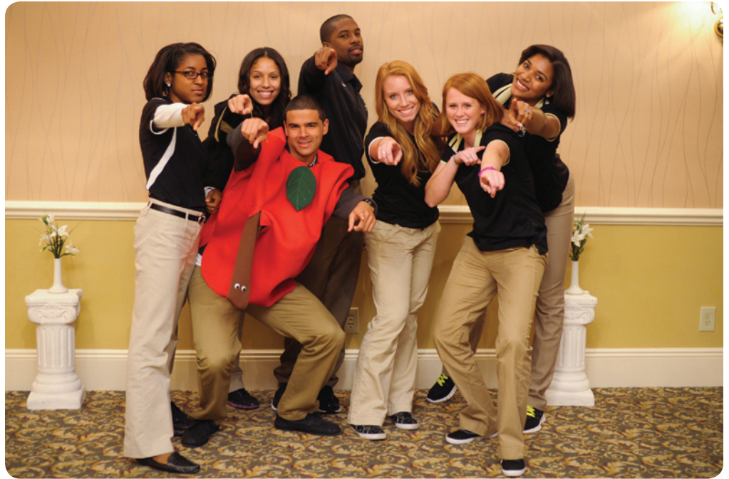
The University of Central Florida's team at the 2012 Charlottesville APPLE conference.