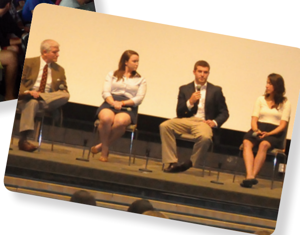
Left: In support of National Hazing Prevention Week, Missouri State University's Delta Zeta and Pi Kappa Alpha chapters sponsored a screening of HAZE with a great turnout!