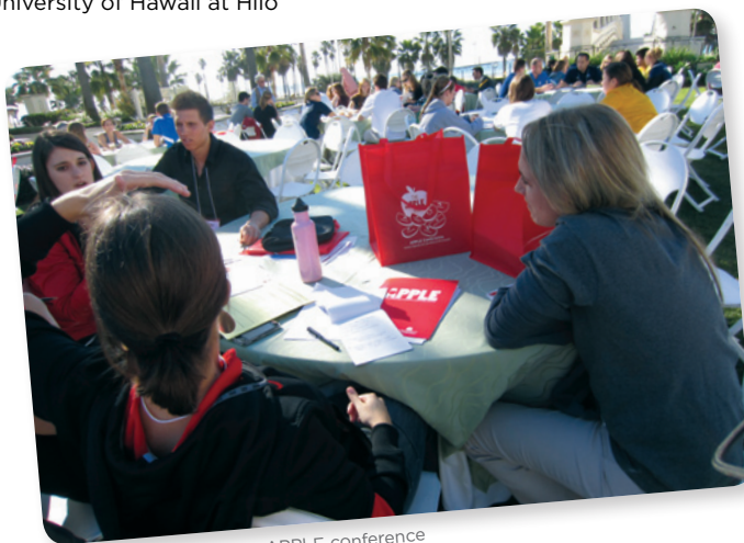
2012 Huntington Beach APPLE conference

University of Texas at San Antonio University of the Pacific University of Toledo University of Tulsa University of Utah University of Vermont University of Virginia University of Washington University of West Florida University of West Georgia University of Wisconsin at La Crosse University of Wisconsin at Madison University of Wisconsin at Milwaukee University of Wisconsin at Parkside University of Wisconsin at Whitewater Utah State University Vassar College Villanova University Virginia Commonwealth University Virginia Tech Virginia Wesleyan College Wabash College Wagner College Wake Forest University Washington and Lee University Washington College Washington State University Weber State University Webster University Wellesley College Wells College West Chester University West Texas A&M University West Virginia University West Virginia Wesleyan College Western Carolina University Western Connecticut State University Western Michigan University Western Oregon University Westfield State College Wheaton College Whitman College Whittier College Whitworth College Widener University Willamette University Wilmington College Wilson College Wingate University Winona State University Winthrop University Wisconsin Lutheran College Wittenberg University Wofford College Worcester Polytechnic Institute Xavier University York College of Pennsylvania Youngstown State University