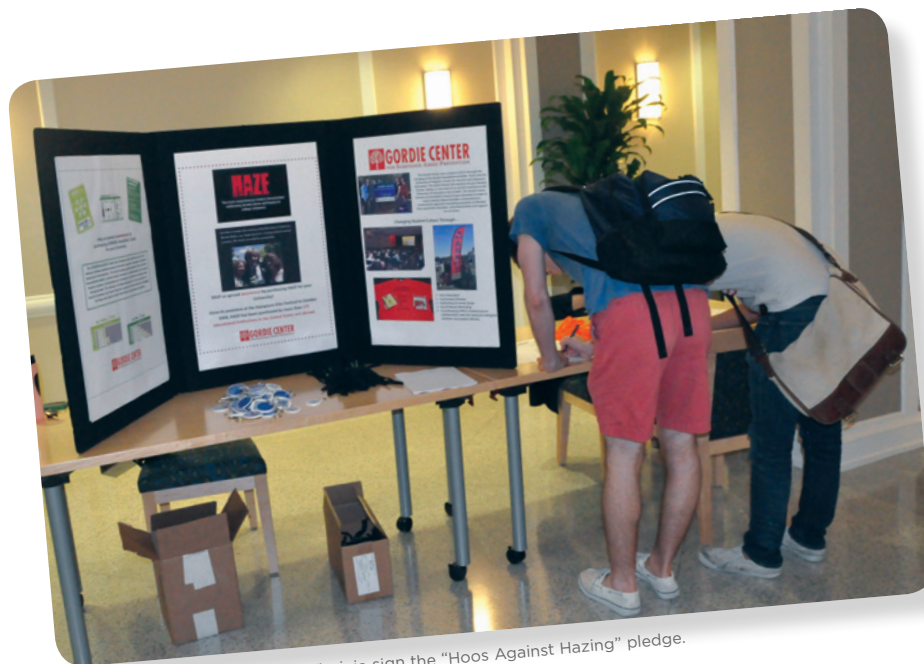
Students at the University of Virginia sign the “Hoos Against Hazing” pledge.

The Fifth Annual National GORDIEday was held in conjunction with National Hazing Prevention Week on September 27th, 2012. Gordie Center staff enhanced the National GORDIEday Planning Guide to provide revised needs assessment tools, additional programming ideas and detailed planning tips. The guide was featured on HazingPrevention.org and may be downloaded at www.gordiescall.org/education/hazing-programs .