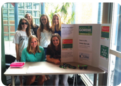
Chi Beta Epsilon members at Trinity University show their support for National GORDIEday.

—Student reaction to seeing HAZE as part of National GORDIEday